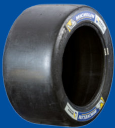
HYBRID (SLICK INTERMEDIATE)